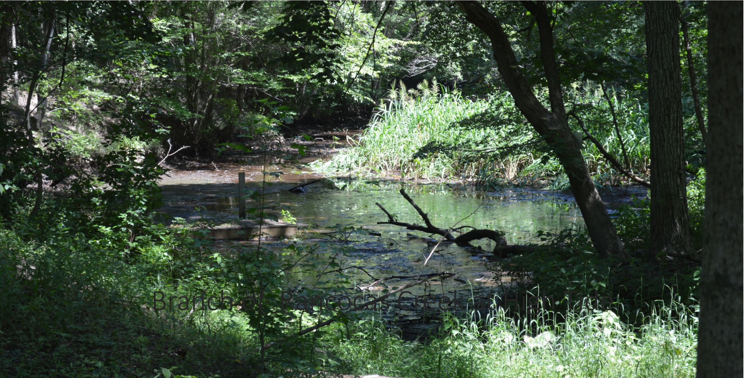
Branch of Rancocas Creek at High Tide